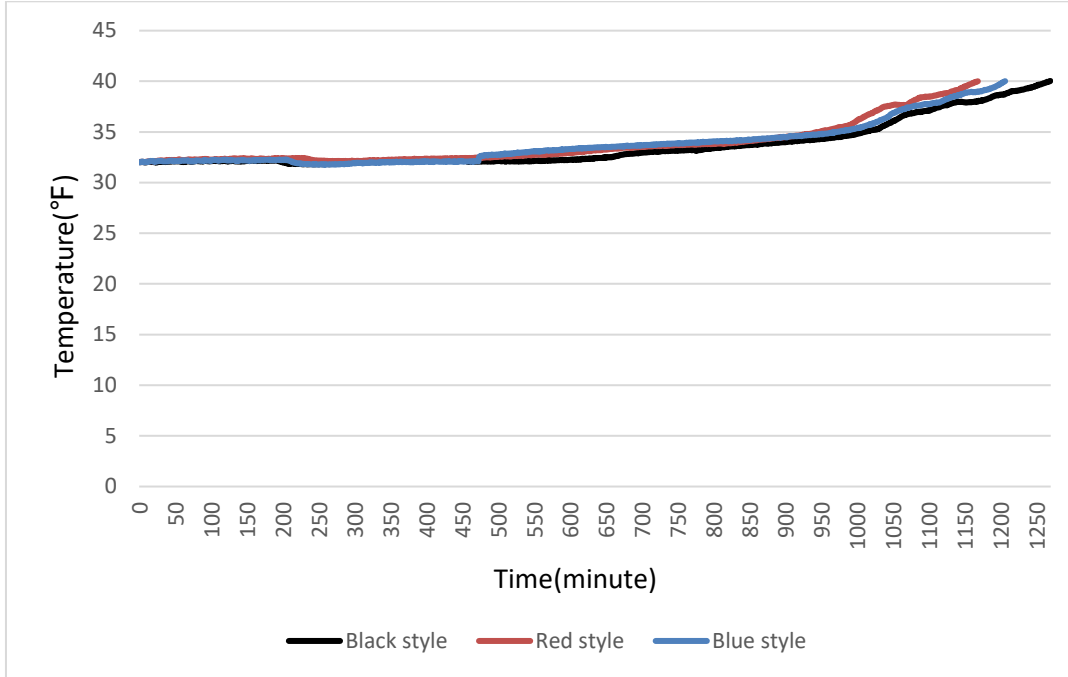
Graph 1 - Cold Retention of Arctic Zone® Titan Thermal HP® Copper Tumbler 20oz